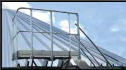
High – single or double platform, located just above the eave

GSI offers three options for platform placement with single or double platform options.