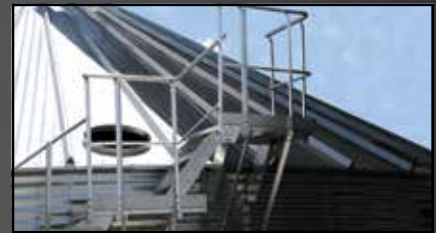
High/Low – combines a low platform in front of manway hole and a high platform to step onto roof (available on bins 60' and smaller - 3 panel roofs only)