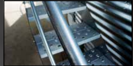
Pre-rolled, 1.5" round tube, smooth handrails allow you to keep your hand on the handrail at all times