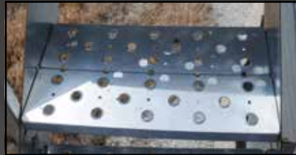
New, 2-piece step design gives you the strength of two steps in one