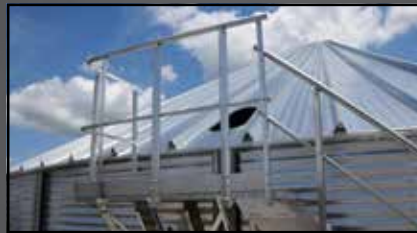
Low – single or double platform, located just below the eave